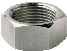
VAA 0100 T1